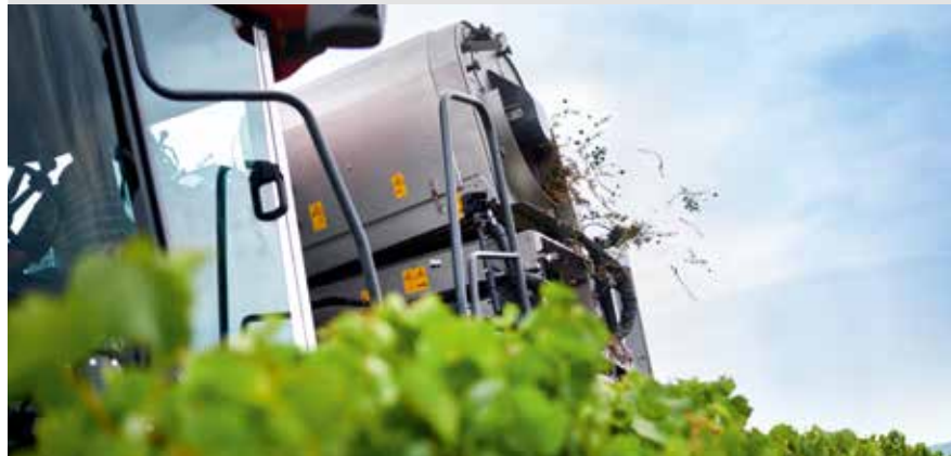
Slope-dependent reverse of the basket turning direction for perfect distribution of grapes at the roller sorting table.