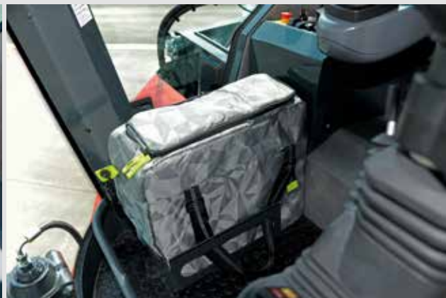
Large storage compartment and electric cool bag