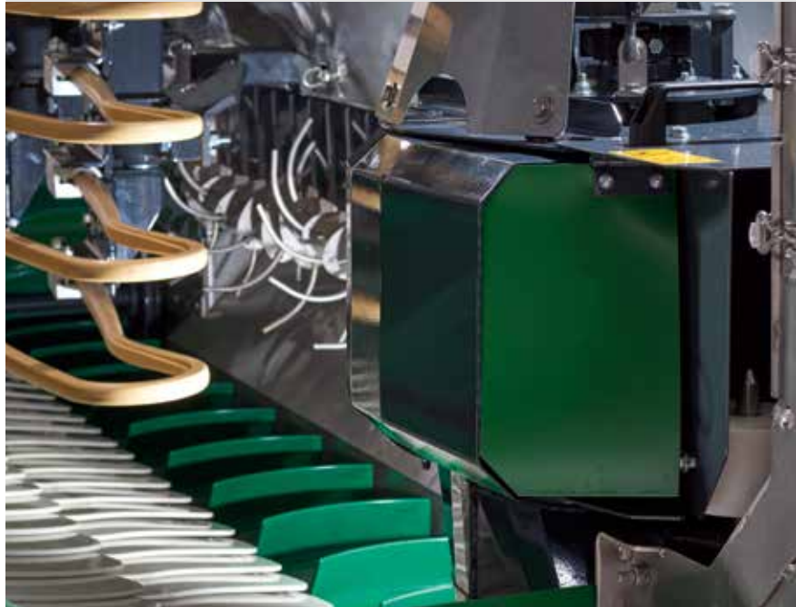
Improved lower suction fan with flexible cover.