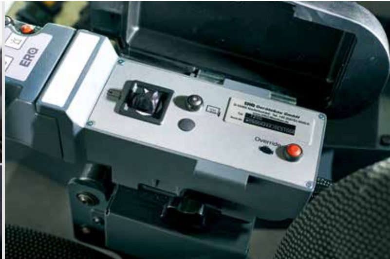
Ergonomic proportional joystick and improved arm rest design