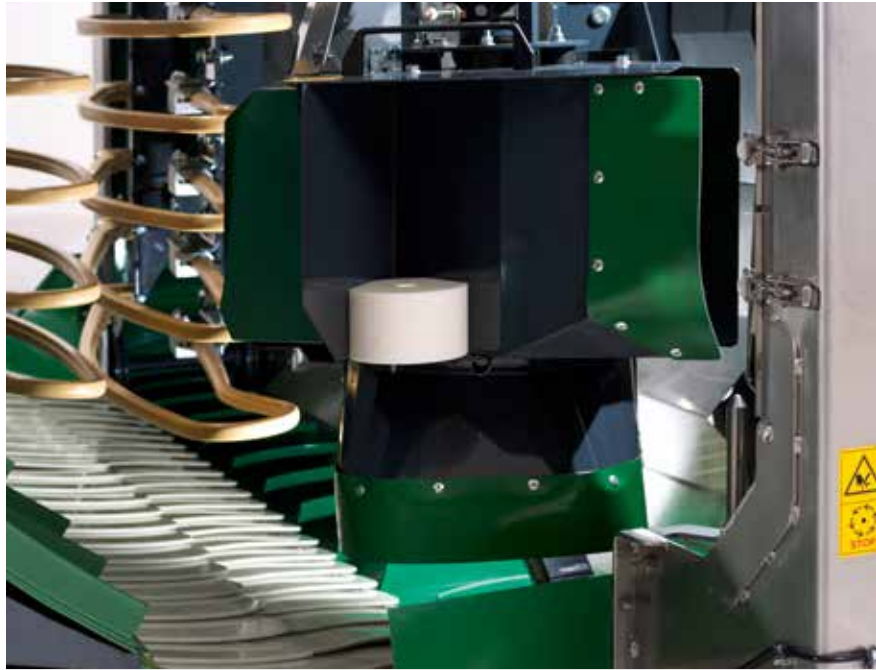
Electric lift for easy access and proper cleaning.