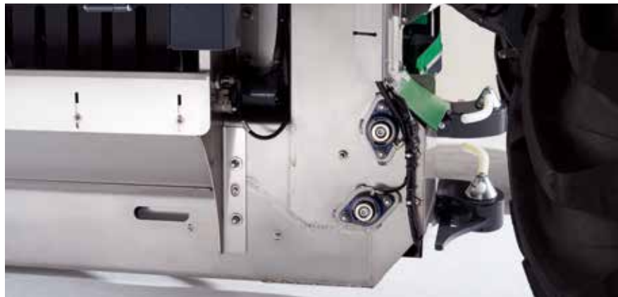
Extending the grape channel by two additional slats reduces fruit dropping to a minimum.