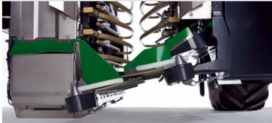
Single sided conveyor system; Cross wind towards the right-hand side of the machine; Angle adjustment of both scale tracks for optimum material flow.