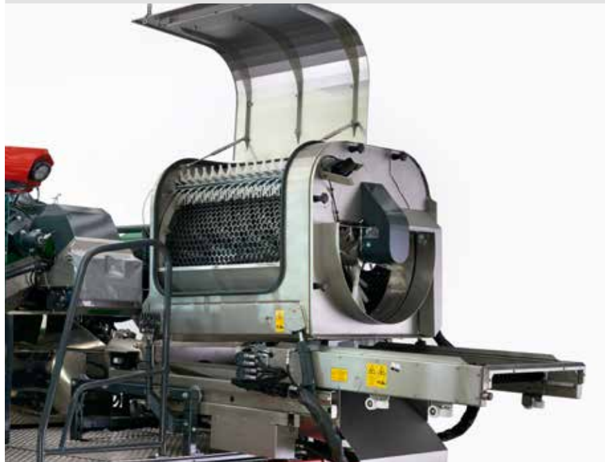
Reduced wash-down time by sealing the access to the destemmer, when not using it.