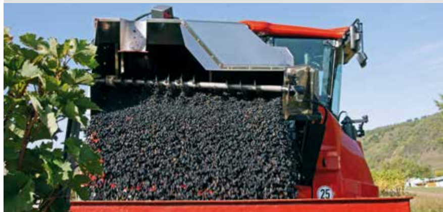
Just like a hand-picked sample.