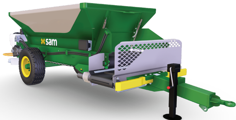
Front view showing banding conveyor

2 for 1 with no change-over time! Designed primarily for spreading compost, vermicast green matter and mulch from the front conveyor. They will also spread fertiliser such as superphosphate, lime and urea through the back-end spinner set up.