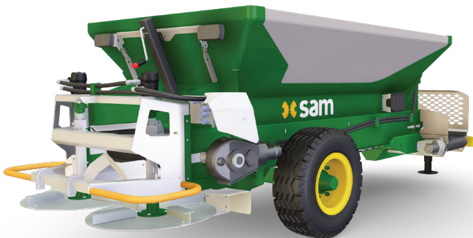
Back view showing spreading discs

2 cubic metre single-axle (top hats available for extra capacity)